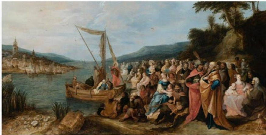
Frans Francken II (1581-Antwerp-1642) The preaching of Jesus on the shores of the Sea of Galilee. Oil on canvas. Signed and dated 1631. CARETTO & OCCHINEGRO