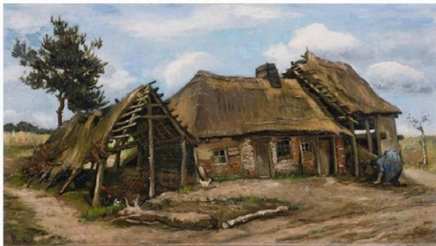
Vincent van Gogh's Peasant Woman in front of a Farmhouse (1885).