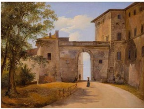
Giovanni Battista Camuccini, "Ariccia. La Porta Napoletana con Palazzo Chigi," ca. 1840-45. Oil on canvas.