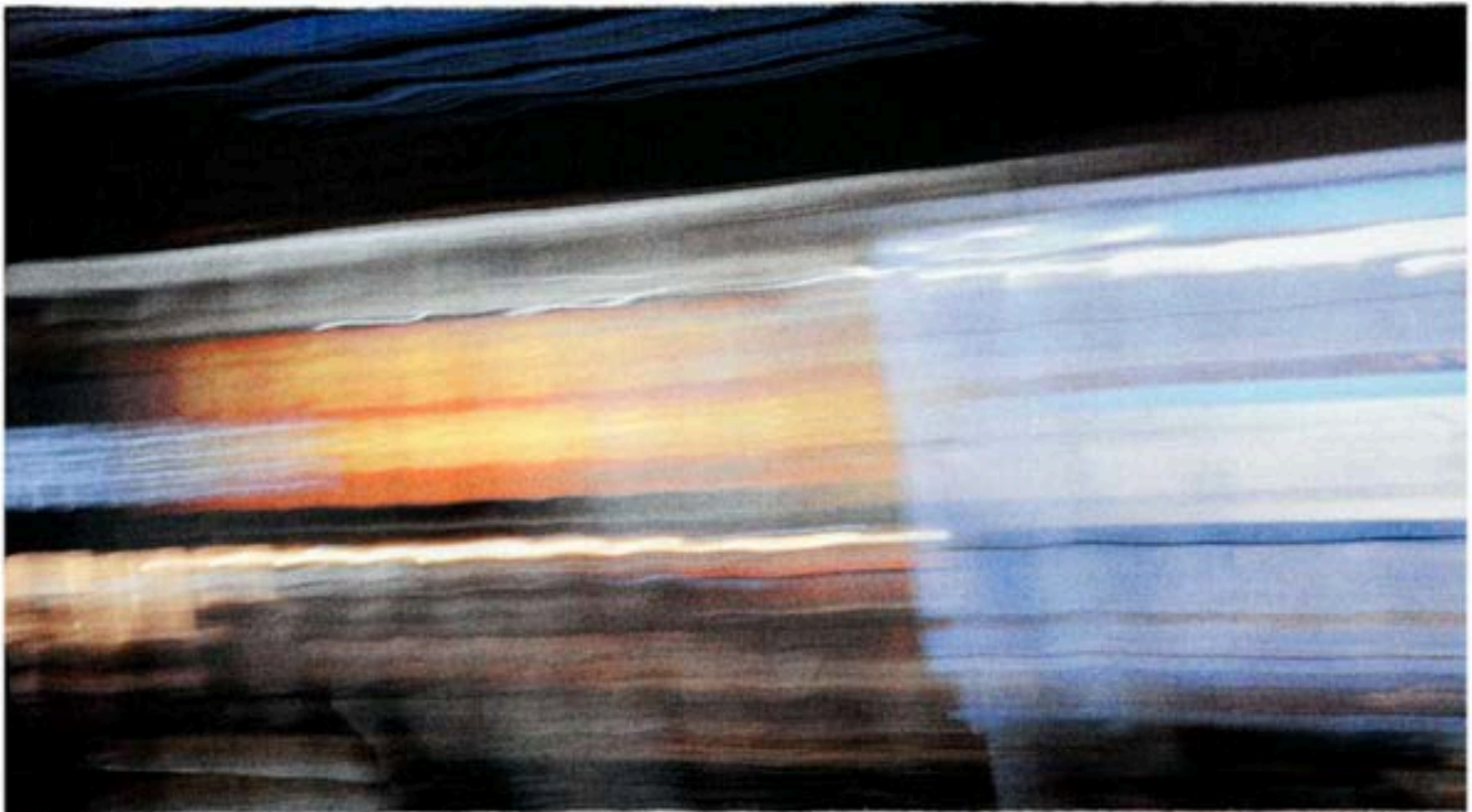
Grethe Sørensen, "Passing By 1", 2011.