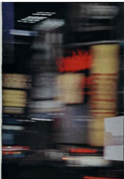
Grethe Sørensen, "Times Square In A Rush 4", 2010.

"We work with a number of artists from Denmark, Norway, Sweden, etc., so here you'll get a unique take on design and art," says gallery assistant Agnes Fouré, beaming at a remarkable limited edition 3-D printed lamp by Ilkka Suppanen called Porcupine . The lamp features 1500 spike-like LED lights, and comes in variations of copper, wood and resin.