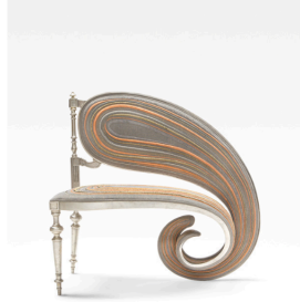
JEAN-FRANÇOIS LENOIR, Phonon , 2013. Patinated bronze, silk embroidered spectacle. By Jean-François Lenoir. 88.5 x 99 x 45 CM / 34.8 x 39.0 x 17.7 in. Limited Edition of 6 + 4 AP.