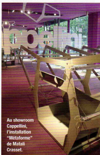
Au showroom Cappellini, l'installation "Métaforme" de Matali Crasset.